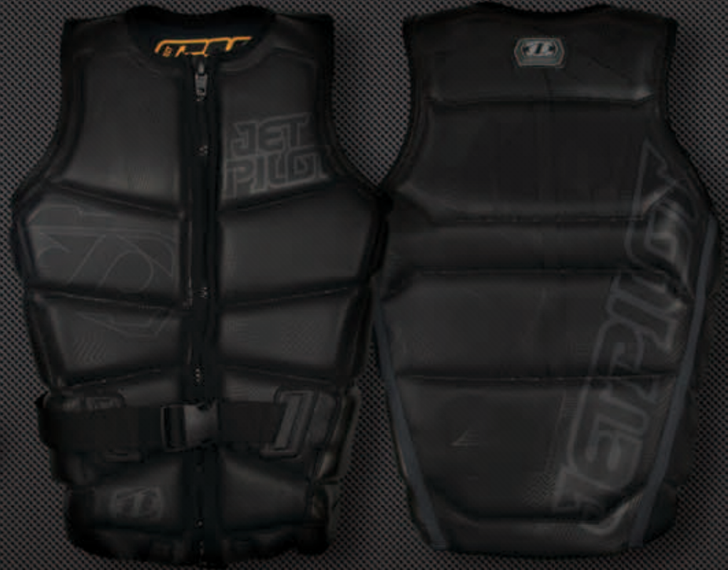
BLACK HEAT EDITION